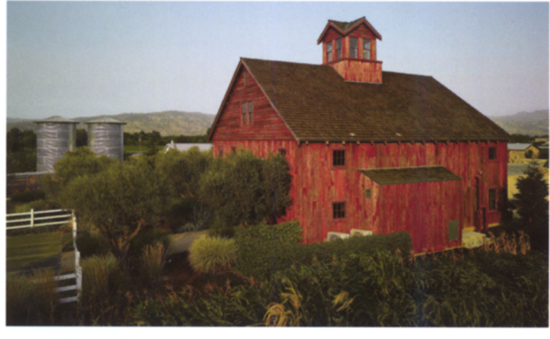
TOP: Silver Oak Cellars' hospitality building. Photograph by Adrian Gregorutti

ABOVE: The historic Gleason Barn at Nickel and Nickel Winery. Photograph by Adrian Gregorutti