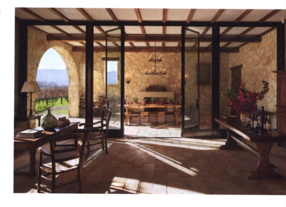
ABOVE: The outdoor tasting area at Kelly Fleming Wines.

The firm's design approach is one of creating sitesensitive and environmentally responsible structures that are at once timeless, innovative, and enduring.