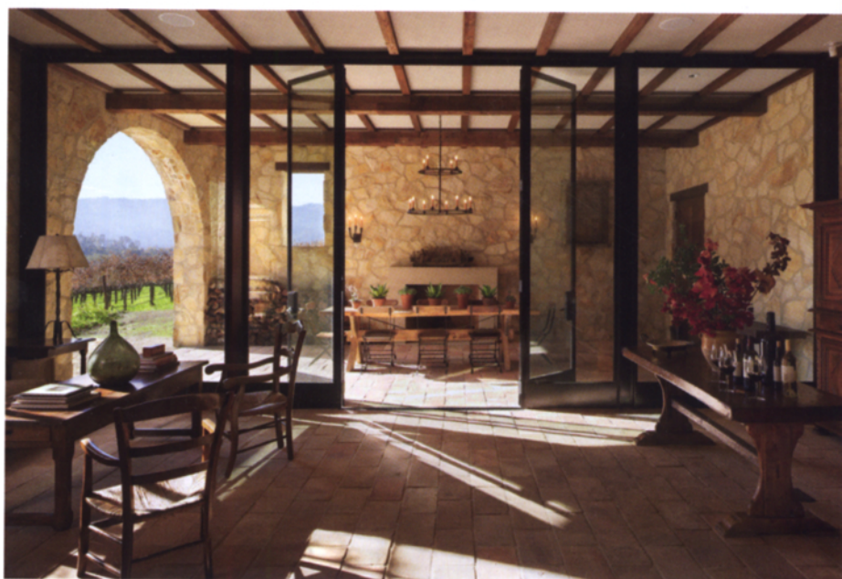
ABOVE: The outdoor tasting area at Kelly Fleming Wines.

The firm's design approach is one of creating site-sensitive and environmentally responsible structures that are at once timeless, innovative, and enduring.